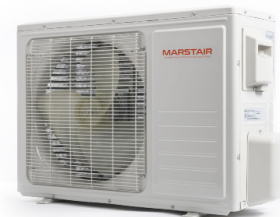
CKA Outdoor Unit