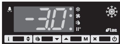
Fig.1 - Front panel