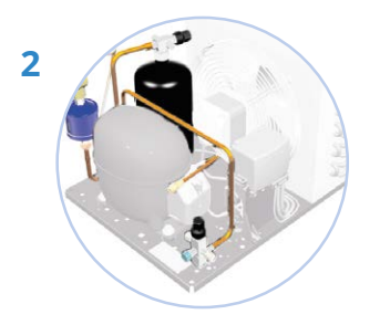
Get Embraco to pre-install line components for you