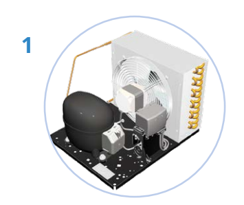
Add your components to a bare Embraco model at your own facility