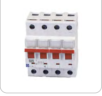
Wide Range of 2 and 4 Pole Modules and MCBs