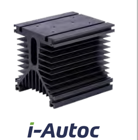
Extremely Reliable AC and DC Solid State Relays to Provide an Extended Service Life