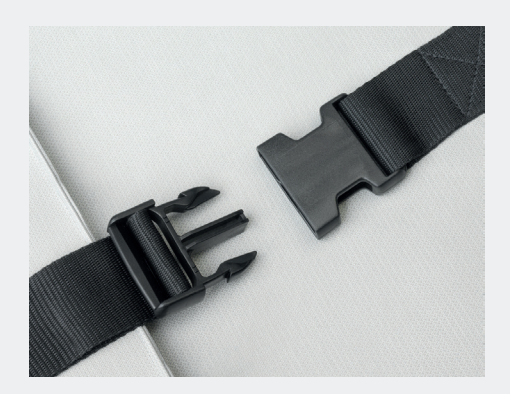
Quick release buckles are used for fixing the jacket quickly and easily.