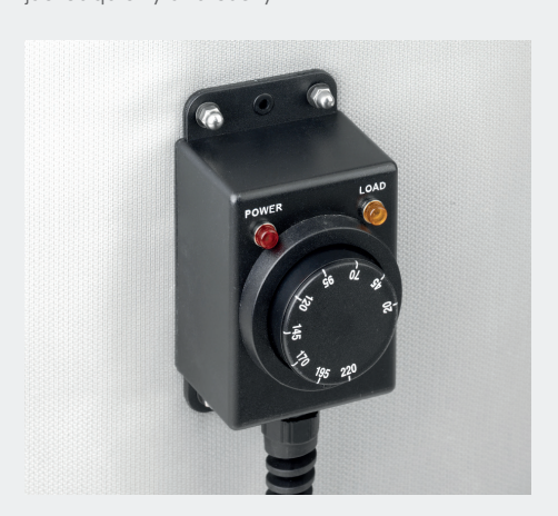
The HTSD is fitted with a high temperature thermostat.