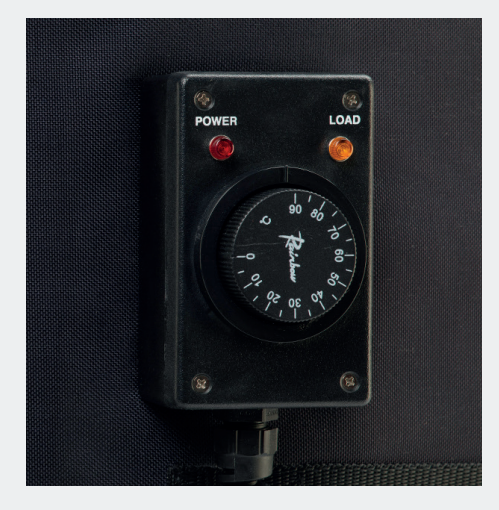
The HISD is fitted with a capillary thermostat for temperature control.

Quick release buckles are used for fixing the jacket quickly and easily.