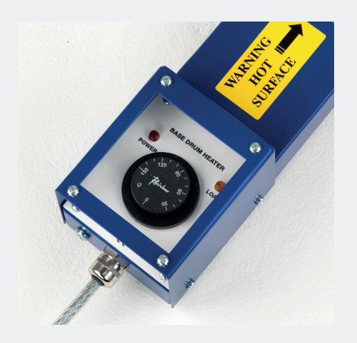
Fitted with a 0 to 150c adjustable thermostat.