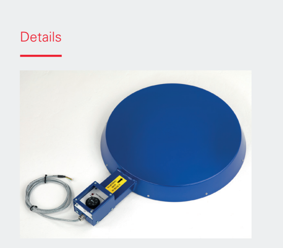
The HBD is suitable for 200-210L drums.