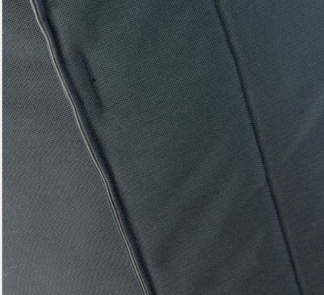
Easy installation with Velcro fixing strips.