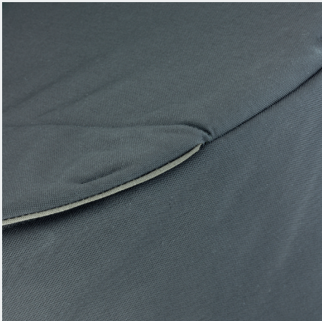
Lightweight and can be used in conjunction with the HBD.