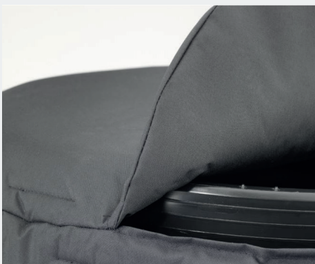
Flap for filler access.