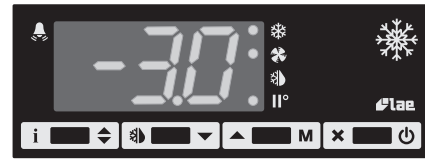
Fig.1 - Front panel