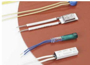
Temperature Sensors & Thermocouples