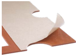
Adhesive Backing for Easy Fixing or Repositioning