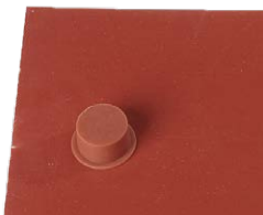
Thermal Limiters and Safety Cutouts