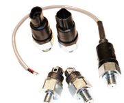
PS61 Subminiature Pressure Switches