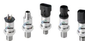
3100 and 3600 Compact Pressure Transmitters & Solid State Switches