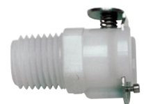
Typical shown: 1/4" NPT Male Pipe Thread with Shut-off Valve

These adapters are available with or without an integral shut-off valve. The shut-off valve will stop line flow when the adapter is removed from the unit. Flow resumes when connected.